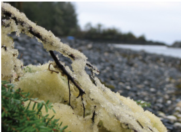
Herring roe on hemlock branches at low tide, Sitka, Alaska.